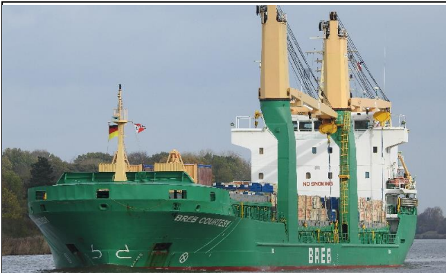
MV BREB COURTESY